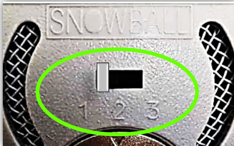
Blue Snowball Mic (Back)