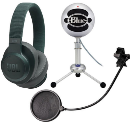
Enhanced Online Equipment Toolkit

Students who have confirmed with the Studio Manager that they already possess equivalent studio equipment prior to enrollment do not have this requirement.