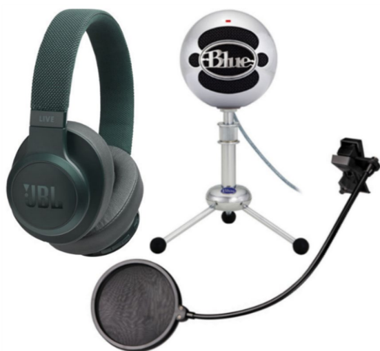
Enhanced Online Equipment Toolkit

There is a $180 fee for the Enhanced Online Equipment Toolkit which can be paid in full at the time of enrollment. Alternatively, a student can pay $60 at the time of enrollment, and then make two more additional automatic payments of $60 each month for the next two months when their lesson subscription package plan renews. If for any reason a student must leave enrollment before the fee is paid in full, the Equipment Toolkit must be returned to the studio within ten days or the balance will be then charged to the student's credit card. Upon receipt of returned equipment, fees already paid for the equipment will be refunded. Alternatively, the student can choose to pay the remaining amount if they want to keep the equipment. Students who have confirmed with the Studio Manager that they already possess equivalent studio equipment prior to enrollment do not have this requirement.