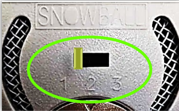
Blue Snowball Mic (Back)