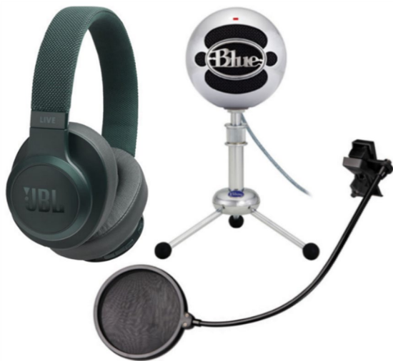
Enhanced Online Equipment Toolkit

There is a $180 fee for the Enhanced Online Equipment Toolkit which can be paid in full at the time of enrollment. Alternatively, a student can pay $60 at the time of enrollment, and then make two more additional automatic payments of $60 each month for the next two months when their lesson subscription package plan renews. If for any reason a student must leave enrollment before the fee is paid in full, the Equipment Toolkit must be returned to the studio within ten days or the balance will be then charged to the student's credit card. Upon receipt of returned equipment, fees already paid for the equipment will be refunded. Alternatively, the student can choose to pay the remaining amount if they want to keep the equipment. Students who have confirmed with the Studio Manager that they already possess equivalent studio equipment prior to enrollment do not have this requirement.